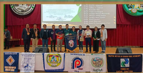
Members of the Philippine Institute of Civil Engineers-Qatar (PICE) flaunt their banner in the photo opportunity.