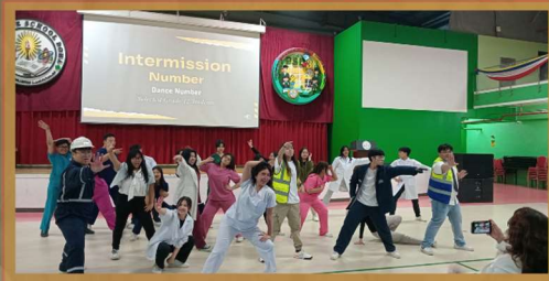
TAKE A BREAK! Various grade 12 students don their future professional attires in another intermission number.