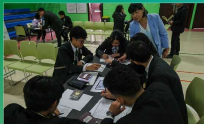
RESPONSIBLE FILIPINOS: SHS students fill out the voter's registration form.