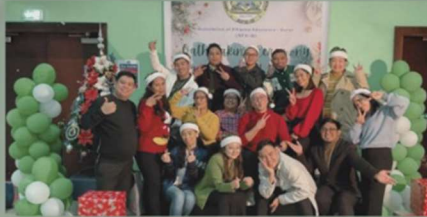
A joyful gathering of AFEQ members , embracing the Christmas spirit for a merry capture.