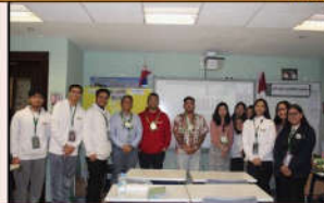
After the parallel sessions were concluded, The Link's editorial board and the resource speakers all smile for the camera.