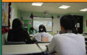
The News Department and the Sports Department were paired together during their parallel sessions in the workshop.