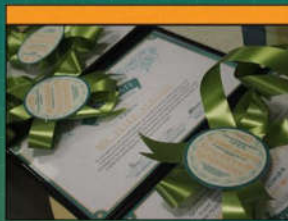
In recognition for their insightful contributions during the Campus Journalism Training Workshop, leis and certificates of appreciation were prepared for the speakers.