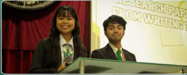
Emcees of the seminar smile for a picture before the program.