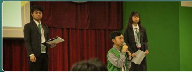
REFRESHER: A PSDian shares his takeaways from the previous research seminar.