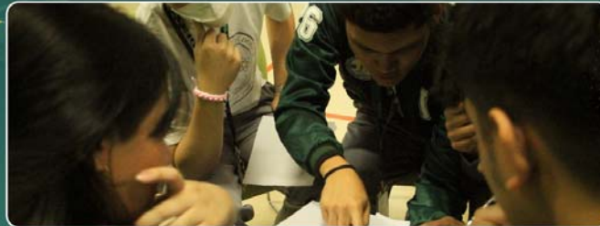
A research group comes up with guide questions.