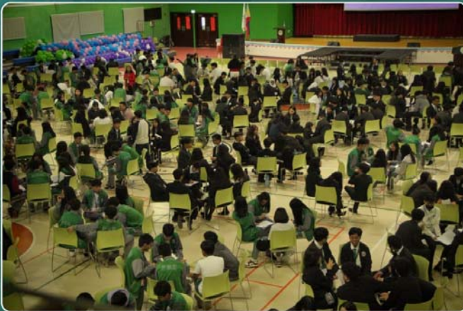
PSDians work according to their research groups in order to fully grasp the discussed concepts for their studies.