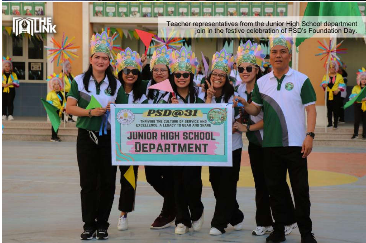
Teacher representatives from the Junior High School department join in the festive celebration of PSD's Foundation Day.

CATEGORY C - Past, Tomorrow and Beyond: A Lasting Legacy to the World