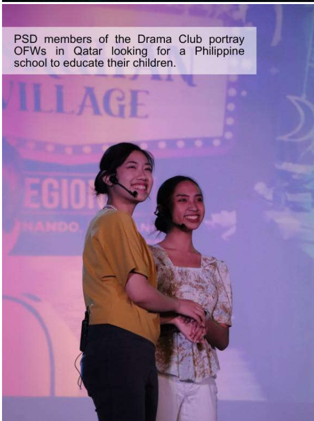
PSD members of the Drama Club portray OFWs in Qatar looking for a Philippine school to educate their children.