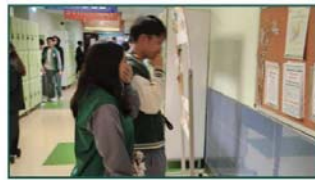
On-lookers are greeted with a surprise every week at seeing another set of math problems.