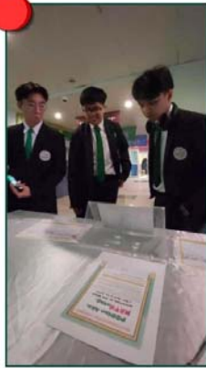
HOOK, LINE, AND SINKER: Challenging math problems catch these potential wizards' eyes!