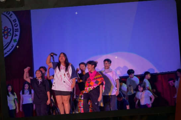
Grade 10 participants proudly proclaim their piece in the Madulang Sabayang Pagbigkas competition.