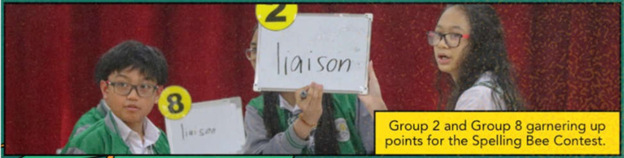
Group 2 and Group 8 garnering up points for the Spelling Bee Contest.