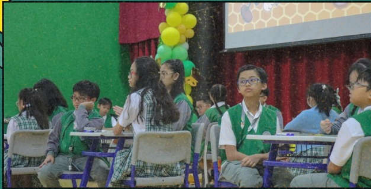
The Spelling Bee contestants await their next question.