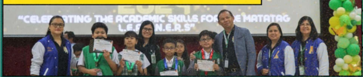
The winners of the MATHtatag Wizards Face Off in the Grade 4 level.