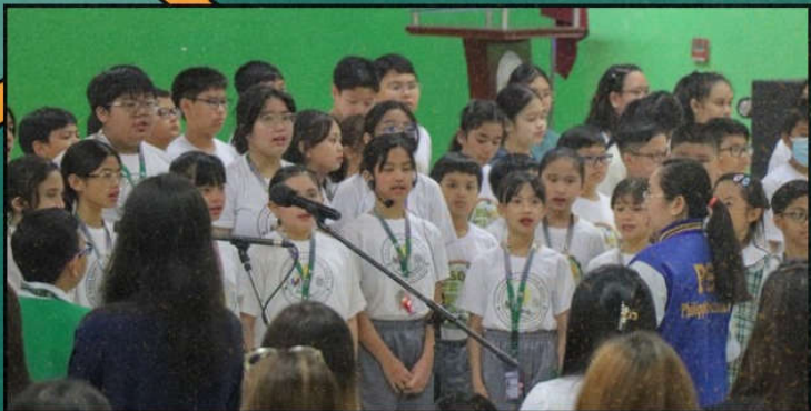
The Intermediate Junior Chorale sings the National Anthems.