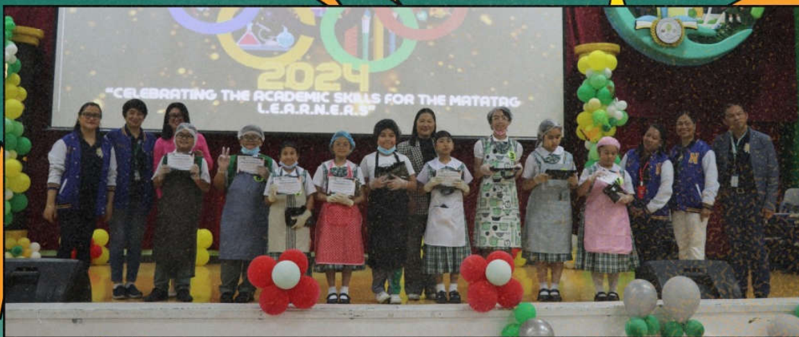
The Grade 4's Sandwich Making Contest participants show off their certificates.