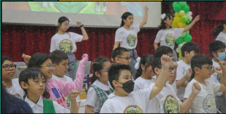
Students from Gratitude and Temperance lead students in the morning assembly.