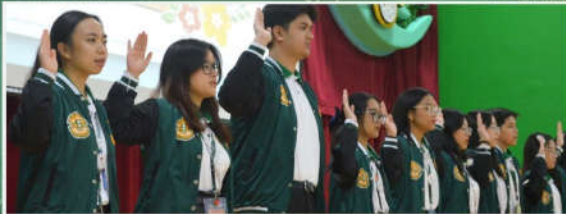
The officers of the Supreme Student Government readily devote themselves to lead with service and excellence.