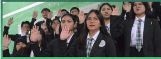
Members of the Commission on Elections take on the school year with their pledge to responsibly carry out their duties.