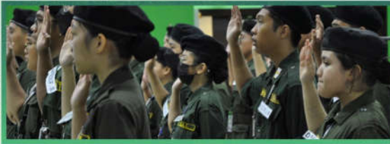
Unwavering in strength and heart, a new batch of C.A.T. Officers vows to fulfill its duty to stand and deliver.