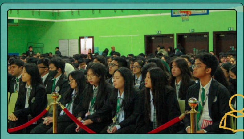
Senior high school students pay attention to the research conference.