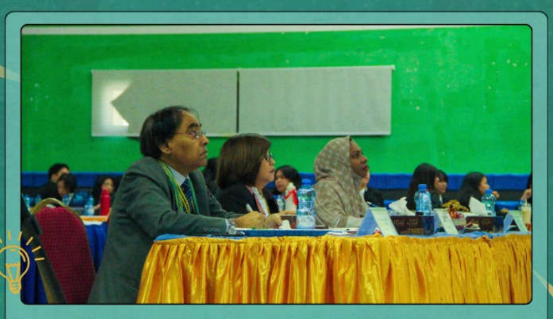
Deep in thought: The judges actively listen to the research presentations.